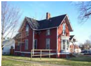
Westside Park Bandstand Original Bandstad shown above, top. Recreated bandstad above, bottom

third the length of the porch to permit a diamond window on the second floor of the south facade. Beyond this point and roughly corresponding to the front wall of the vestibule, the roof becomes a steep shed roof with a cricket at the end to mask the transition from the front gable roof. The front porch shelters a relatively simple front door with triple eared and molded trim similar to the windows. This door has a single three-quarter length light with two lower inset panels. There is a single light transom over the door.