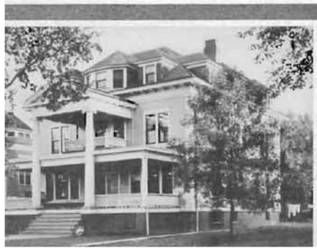
Old TKE House.

A rendering of the new house was published in the 1932 Illio, no doubt in hopes of breaking ground soon. The new Phi Pi Phi house would have been a radical new presence, not only on Green Street, but anywhere on the University campus. Instead of the popular period revival Georgian or Tudor houses of Fraternity Park, the new Phi Pi Phi house was to be an exercise in the Arte Moderne, a gleaming collection of cubes with a smooth surface and bands of wrap around glass-block windows. The main block was three stories tall with two lower wings, which probably formed sun terraces. The whole structure seems to have a completely flat roof, which would have been a maintenance nightmare in the snowy mid-west.