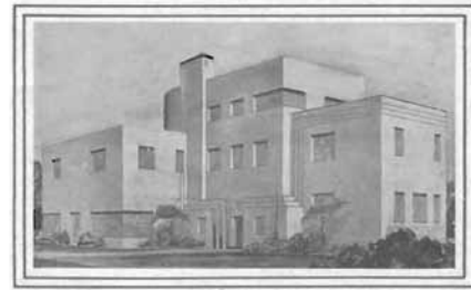
Architect's drawing of the Art Deco Phi Pi Phi.

do with the old house on Green Street and put their radical new design aside until better times. By the time the nation had recovered from the Depression, the Phi Pi Phi fraternity had been dissolved and consolidated with Alpha Sigma Phi in 1939. The Alpha Sigs were more conventionally minded. Their house on Armory Avenue was a perfectly ordinary exercise in the classical revival and Green Street never got it's little bit of Hollywood.